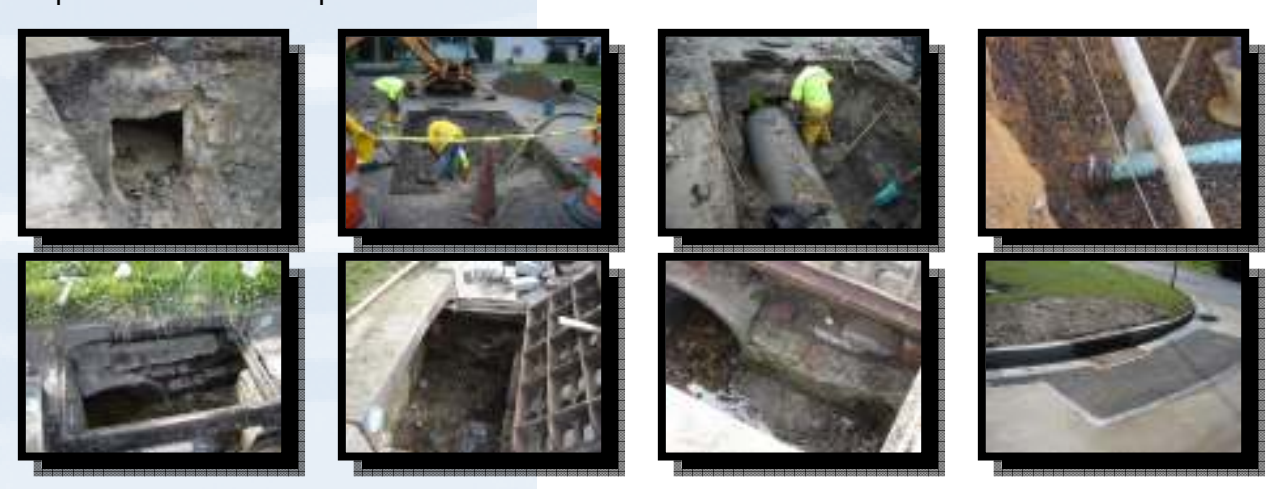
PCI Professional Consulting, Inc.

This project involved the design documentation and specifications to Miscellaneous repairs including but not limited to road restoration and maintenance work to pavement, catch basins, storm water inlets, concrete curbs and gutters, utility mains, and sinkholes, milling and paving, saw cutting, excavation, structural repair or replacements, pipe laying, compaction, striping, landscaping, masonry, and maintenance of traffic. PCI prepared design plans, managed the bidding phase and the construction work including approval of pay applications and status reports to the Township.